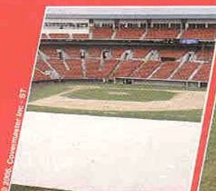
Covers for baseball fields are readily available.