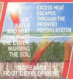
It works on the greenhouse principle, every time!

covermaster.com E-MAIL: info@covermaster.com