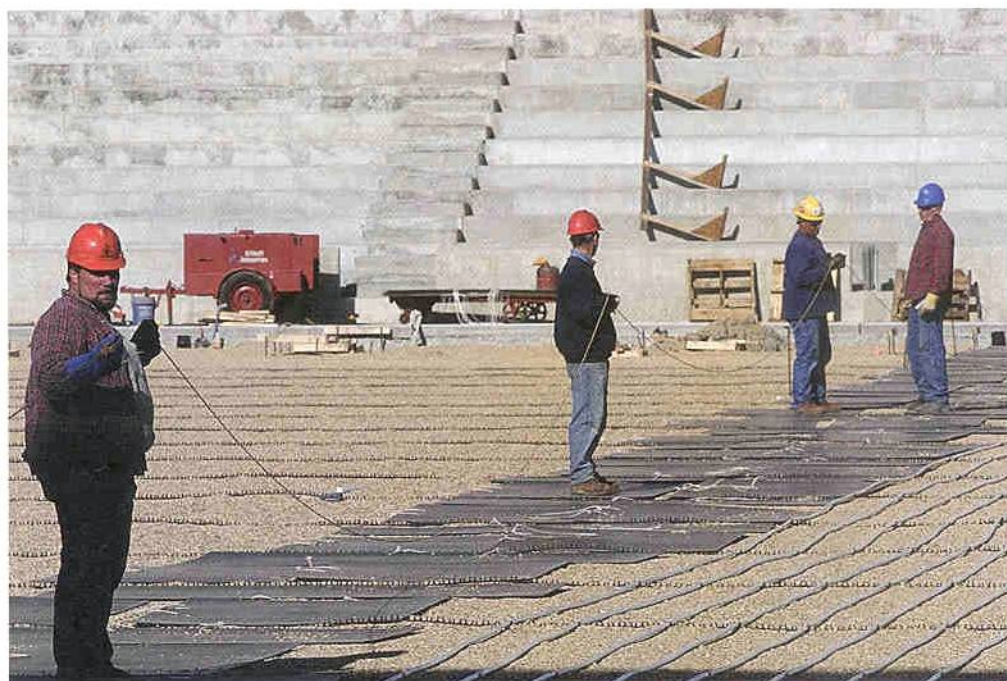
To prevent dimpling of surface with shoe prints, Althoff mechanics stood on sheets of Masonite while working on the field surface.

The rail system is a major upgrade over an older method of securing the tubing to the field. The latter involves hand-tying the PEX to a wire grid covering the pea-gravel surface. That process is not only more time-consuming, but also requires more bending and crouching by the installer.