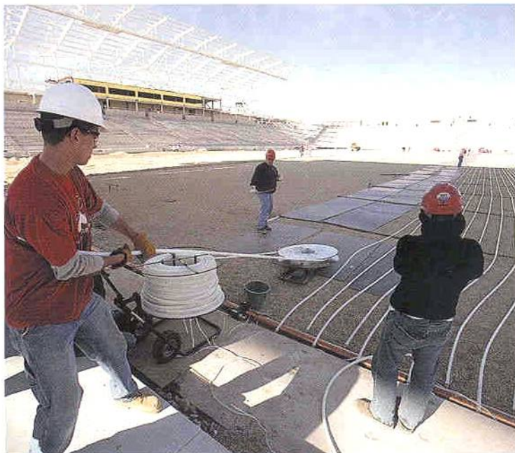
Motorized sled, custom-made for the project by Althoff Industries, carried the loops of PEX tubing from one end of the playing field to the other.

Soldier Field projects. "Once the concrete is poured, it's pretty difficult to fix any leaks."